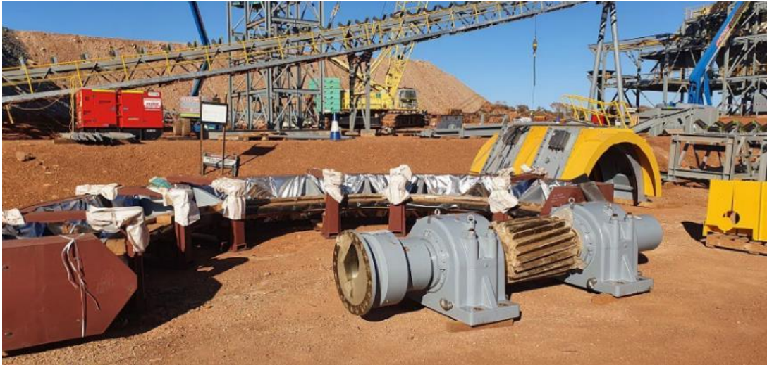
Figure 9 – Ball mill gear & pinion.