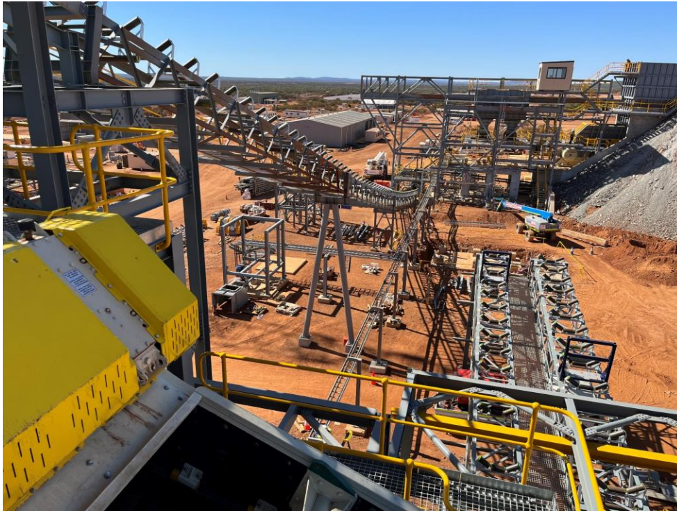
Figure 5 – Abra crushing & Screening sections steel erection (photo: 12 July)