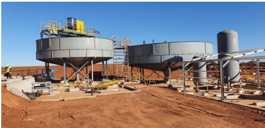
Figure 8 – Thickeners.