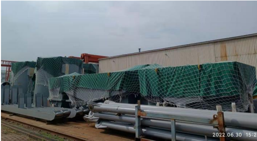
Figure 11 – Flotation cells waiting shipping.