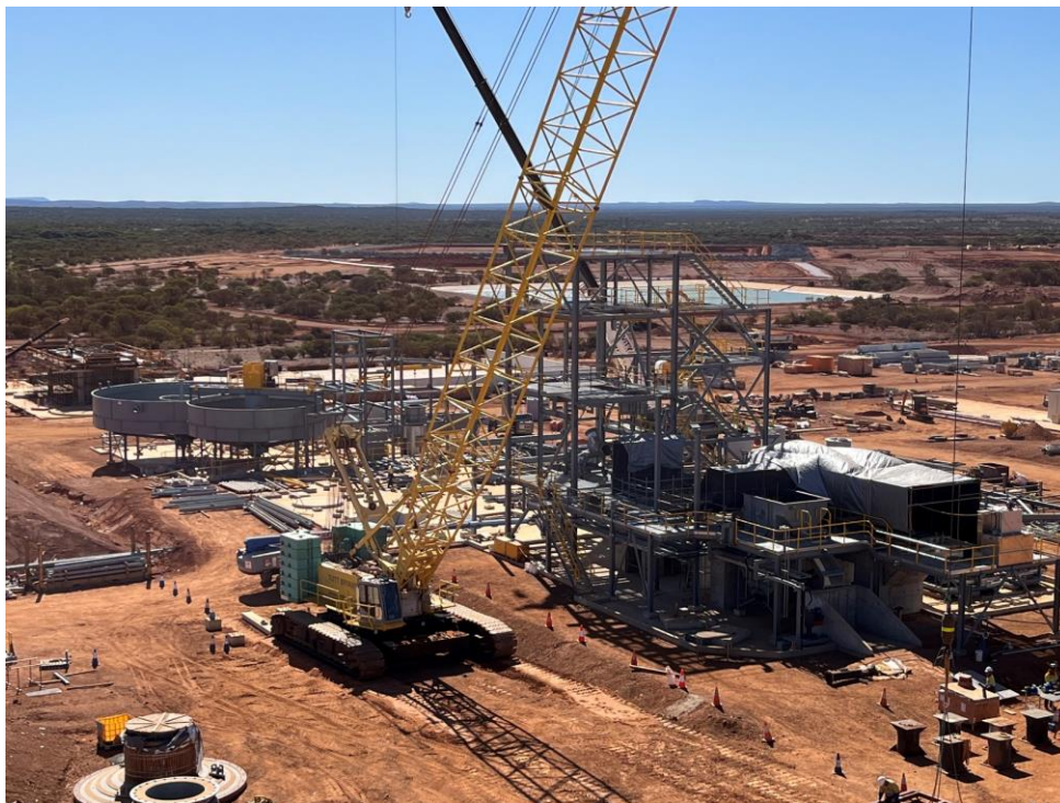
Figure 4 – Processing plant construction, mill, flotation, thickening and concentrate sections (photo: 12 July 2022).