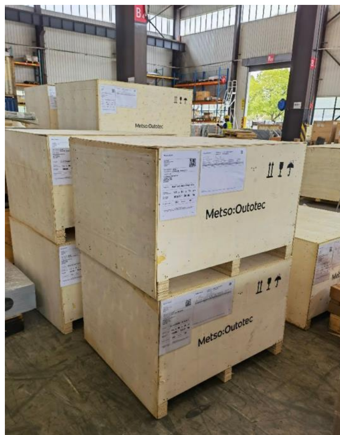
Figure 12 – Flotation cell drives waiting shipping.