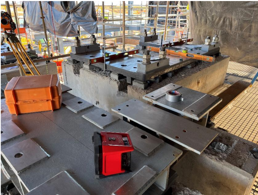
Figure 7 – Mill drive train sole plates (Photo taken 12 July 2022).