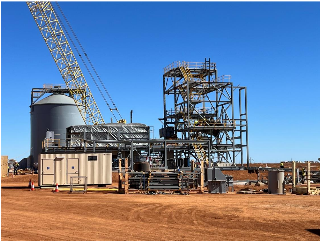
Figure 10 – Mill section.