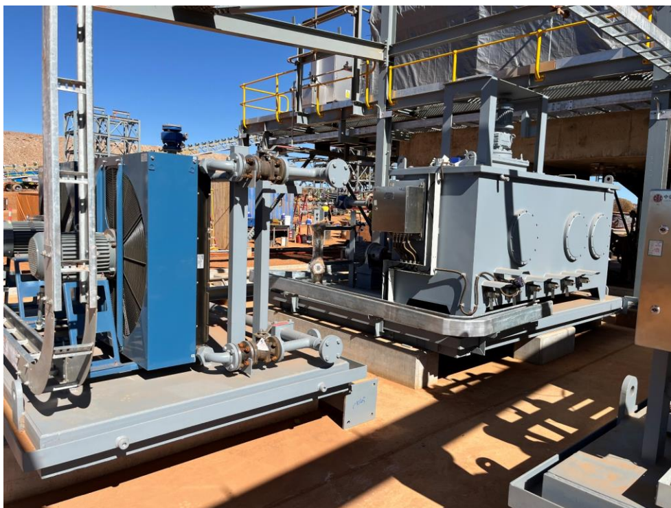
Figure 6 – Mill bearing lubrication equipment (photo: 12 July).