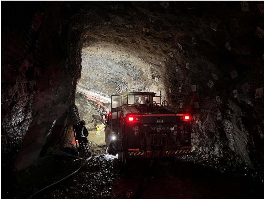
Figure 13 – Abra underground, decline development.