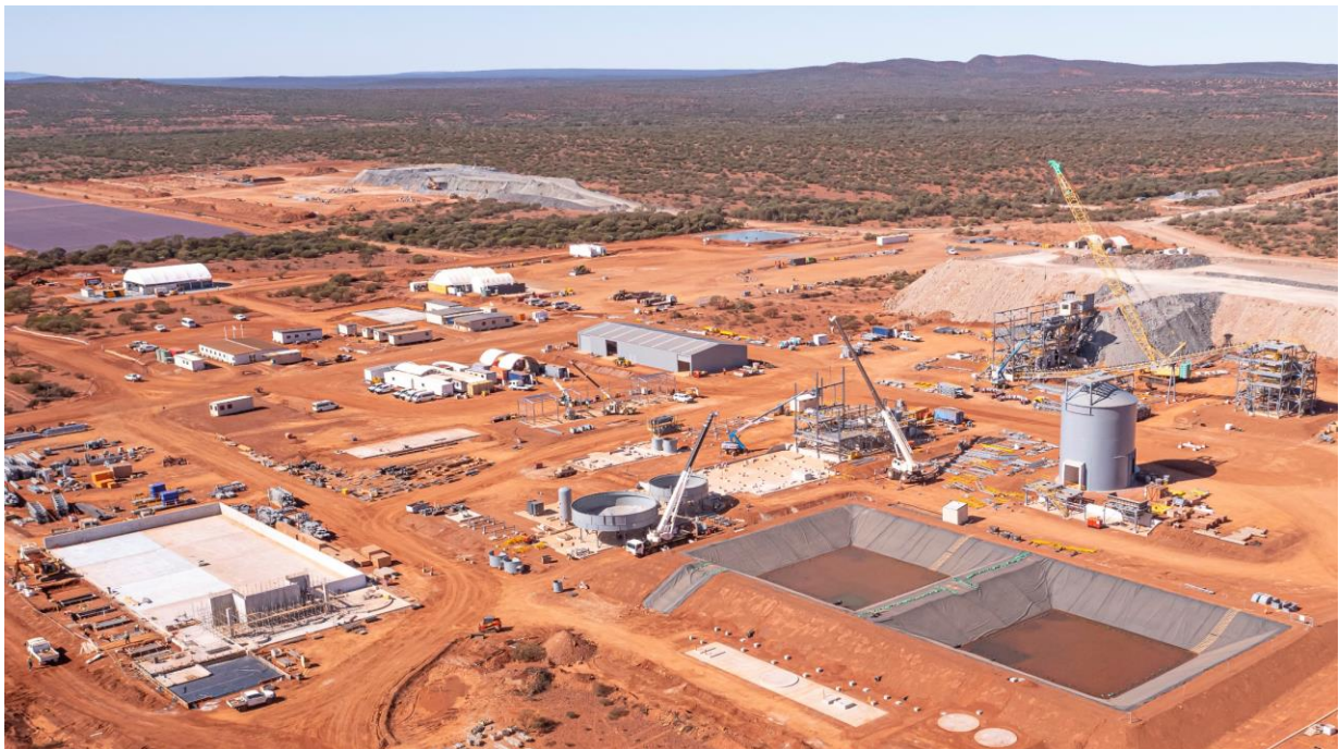
Figure 1 – Abra mine construction site (photo: 28 June 2022)

Decline mining delays occurred over 12 days in June, when the decline intercepted an un-grouted drill hole, which produced water, requiring an increase in pumping capacity. This was quickly rectified, and the mine plans were updated to keep the mining schedule aligned with the plant construction and commissioning timeframe. Underground grade control drilling continued in June in preparation for ore mining as planned”.