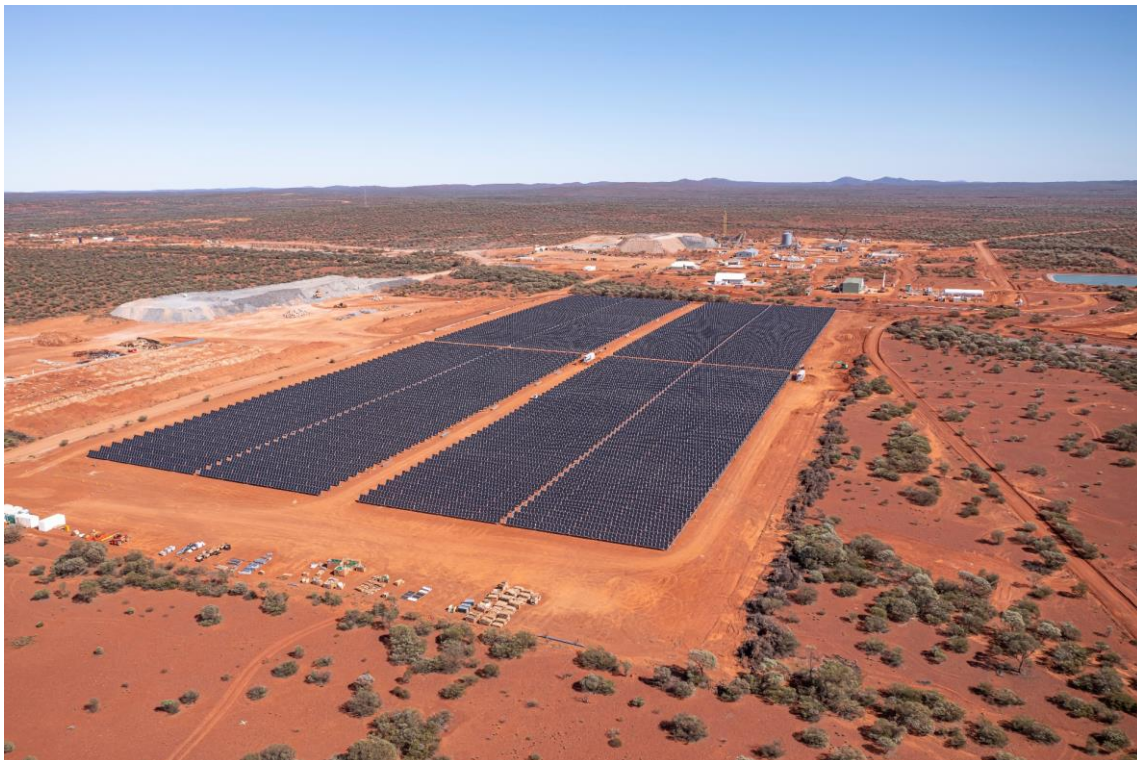
Figure 14 – Abra site installed solar panels.