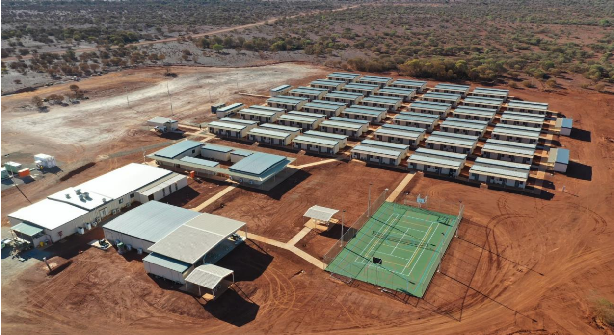
Figure 2. Completed 280 room Abra accommodation village.