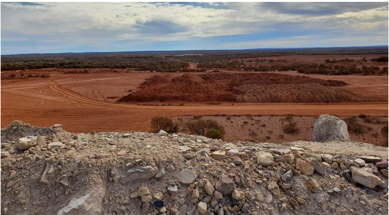
Figure 3. Cleared site of Abra's future processing plant (picture taken from the top of the ROM pad).