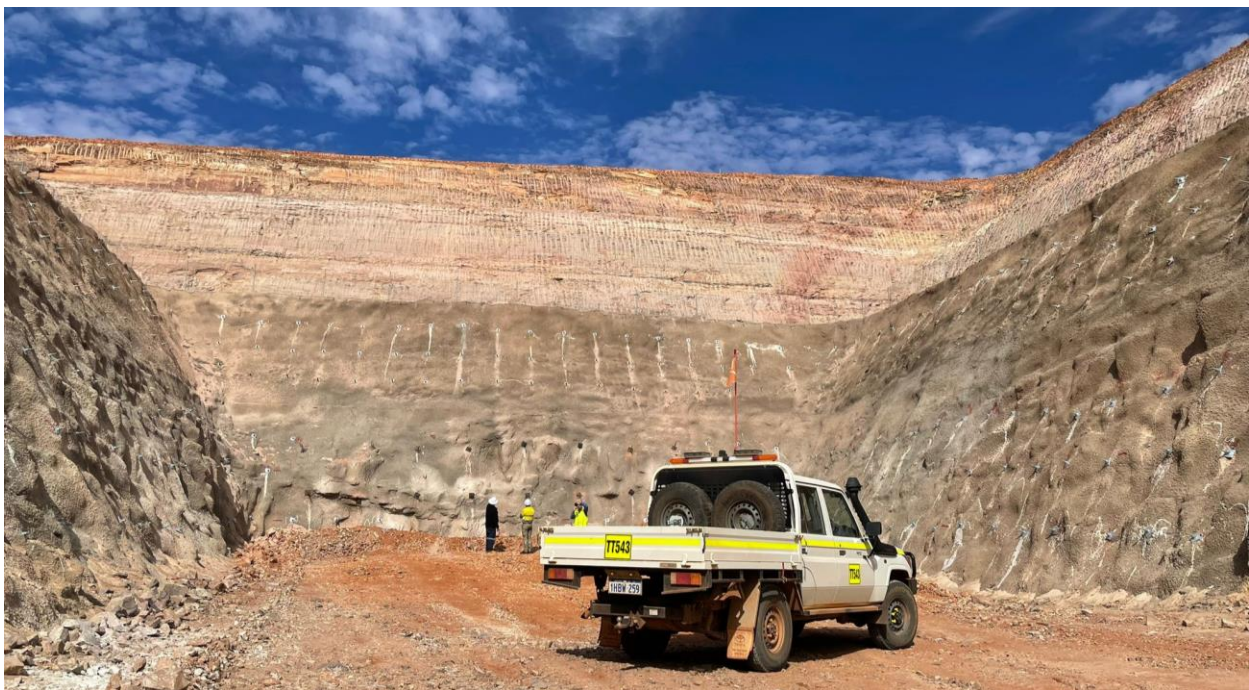
Figure 1. Box-cut with ground support works.

Figures 1-4 (below) show various photos of Abra Project progress taken during the Quarter.