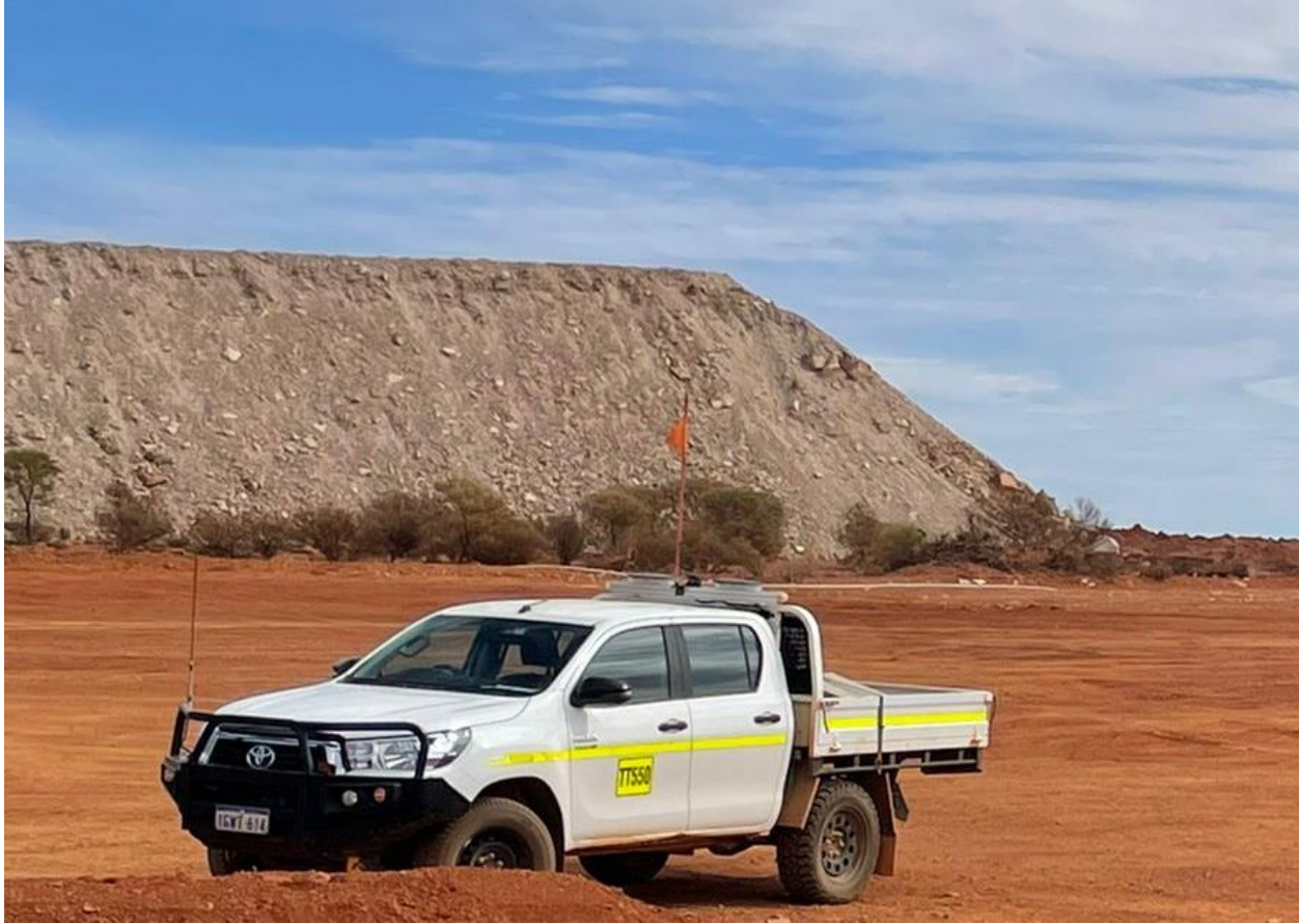
Figure 4. Abra ROM pad.

Completed Project works include: construction and commissioning of a 280-unit mine site village; mining of the box-cut; box-cut ground support works; ROM pad preparation; installation of production water infrastructure (bores, pumps, storage and water reticulation); installation of site communications; and various site clearing, roadworks and civil works. As a result, Abra is largely prepared for the deployment of key contractors for the construction of the plant and ancillary infrastructure, and deployment of the underground mining contractor. In addition, 90% of contracts (by value) covering the Project's remaining full development works are executed or awarded.