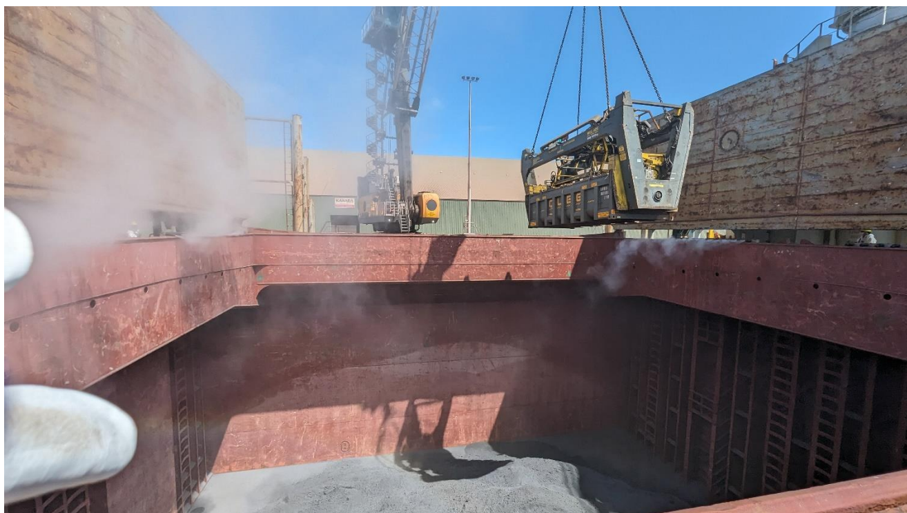
Figure 2 – Qube Logistics Services transferring the Rotabox™ containers to the ship for unloading. Once inside the ship’s hold, the lifting mechanism rotates the container to place the concentrate in the hold (photo 7 November 2023).