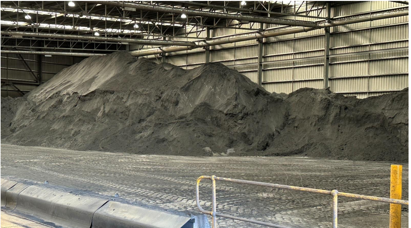
Figure 2 – Picture showing approximately 9kt of lead concentrate in Abra’s concentrate storage shed (Photo 5 June 2024).

The Board of Directors of Galena authorised this announcement for release to the market.