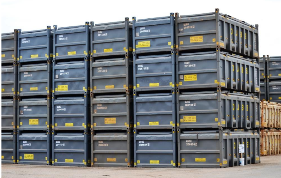
Figure 2 –Lead-silver concentrate containers at the Geraldton Port waiting transport for ship loading (Photo 24 March 2023).