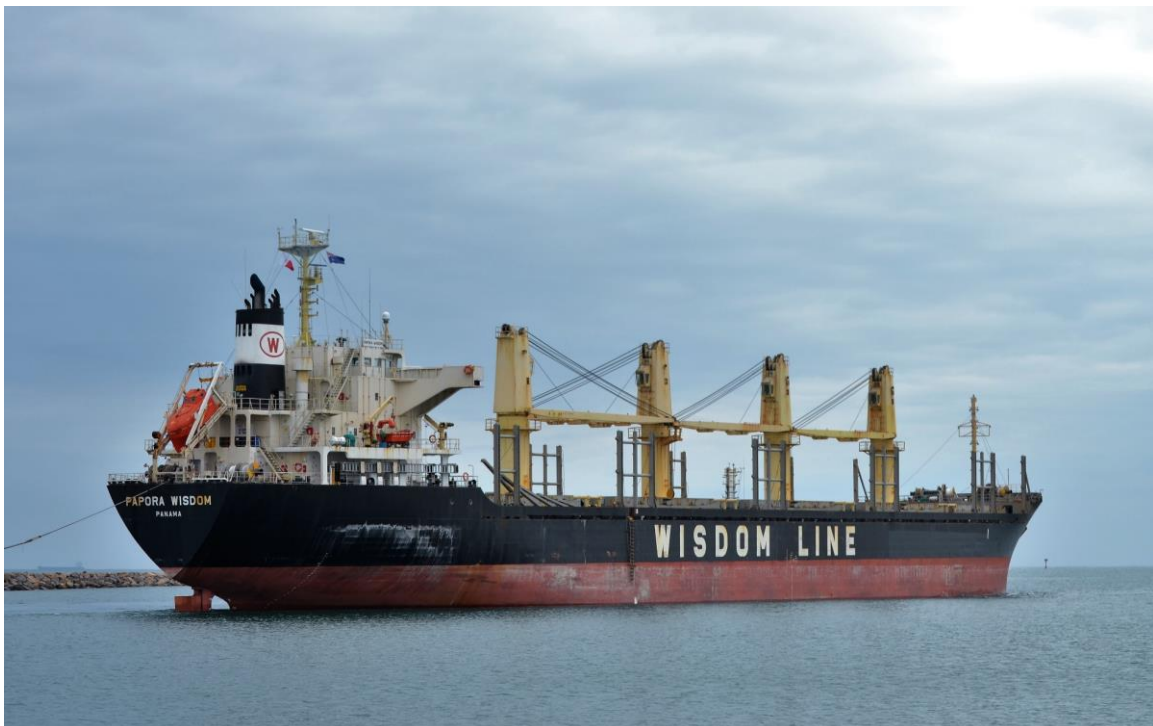
Figure 1 – Vessel “Papora Wisdom” departing the Port of Geraldton containing the first Abra concentrate shipment (Photo 25 March 2023).