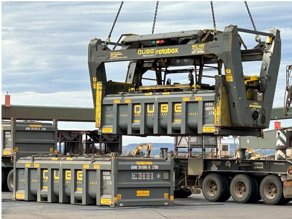
Figure 4 – Closeup view of the Rotabox system at work with the lifting and transfer of concentrate to the ship hold. Once inside the ship hold, the lifting mechanism rotates the container to place the concentrate in the hold (Photo 24 March 2023).